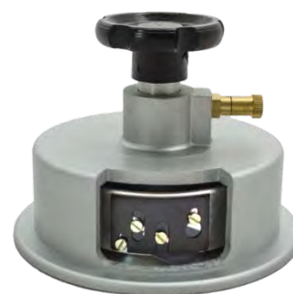
Optional Fabric Cutter To be used with g/m 2 program